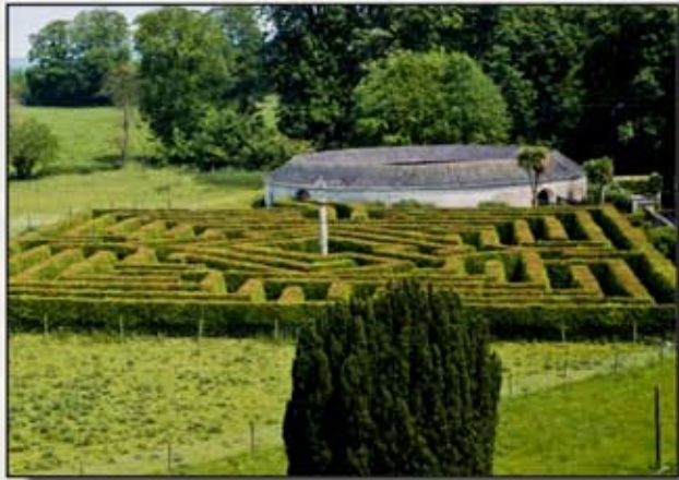
Entrance to the Maze

Adults & Children ..... €3 Family Admission, ..... €10