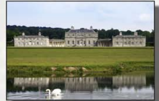
• The most beautiful house in Ireland •

OPEN 10.00am - 6.00 pm (Last Admission 5.00 pm)